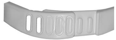
Adjuster in position 3

TO USE: First set the SnoreMender strength by connecting the adjuster. The SnoreMender can be set in 8 different positions. 1 peg connected is the weakest position. Positions 6 to 8 require modifying the strap (see 'Additional Strength Settings'). You should use the lowest strength that is effective.